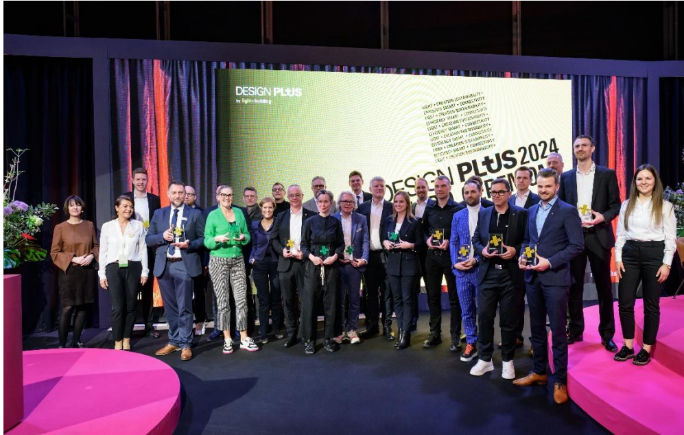
Designplus winners 2024 have been announced.